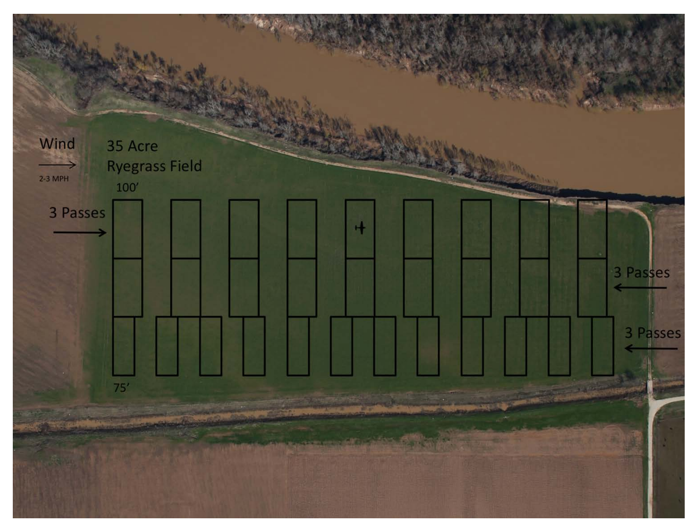
Figure 1. 35-acre ryegrass field with prescription application map overlay used for testing the system response of a variable rate aerial application system. The black boxes are 75' and 100' spray zones where 3 GPA of glyphosate solution were sprayed.

For three consecutive years, a 35-acre research field was planted in a winter cover crop. This provided a nice green background for early spring of the following year. We created a binary on/off prescription map for the field (Figure 1) and sprayed glyphosate (32 oz./acre) over the field according to that prescription using our Air Tractor 402B equipped with a Satloc M3 IntelliStar system and 35 VeriRate nozzles (Figure 2). The airplane was flown at 130 mph with a spray swath of 65' and target application rate of 3 gallons per acre (GPA). The first year, we evaluated multiple 100- and 300-foot spray zones flying into the wind. The next year, we tested 50- and 100-foot spray zones into the wind. Earlier this year, we looked at 75-foot and 100-foot spray zones, applied both upwind and downwind. A Cessna 206 equipped with multispectral cameras was used to take aerial imagery immediately before and 14 days after the spray application. This allowed us to see exactly where the spray landed.