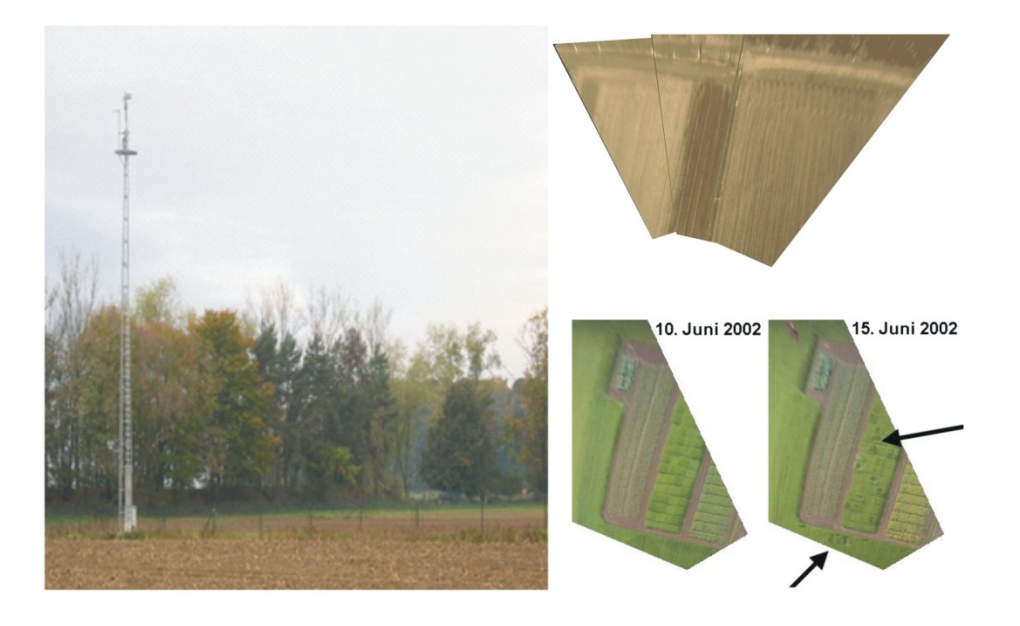
Fig 4. Principle of LASSIE (Left: pole with 360° rotating digital camera with flexible tilt; Right, top: conversion of aligned, oblique images into a geocoded pseudo-nadir image; Right, bottom: dynamic mapping (Lilienthal et al. 2004b))

VR application of N is popular among farmers. Various ground-based sensors are employed to estimate the N demand and adapt N rates accordingly. Among all nutrients N has the strongest effect on the chlorophyll content of plants and reflectance spectra are used to determine NDVI and red edge, which are set in relation to the chlorophyll content or N status. Thus the causal chain: green color of plants – chlorophyll content – protein content – total N content – N status of plants has been extended by N supply of plants from the soil, ignoring basic knowledge of natural science. The first two assumptions are valid under ceteris paribus conditions as there are many more factors affecting the green color of plants and chlorophyll content than just N, as for instance deficiency of other nutrients such as S, K, Mg, Mn, Zn and Cu, genetic dispositions, pests and diseases, drought, water logging, soil compactions and other physiological disorders. Images of the vegetated soil reveal different patterns in the field, but causal factors are unknown so that a ground truth is inevitable. The same applies to low-cost hyperspectral spectrometers which permit pseudo-imaging with the Penta-Spek system in order to assess spatial variation of crop parameters such as N status, LAI, grain protein content and yield. Bottom line is that no matter how sophisticated sensor technology might be, validation of data must be obligatory for producing precise and reliable results.