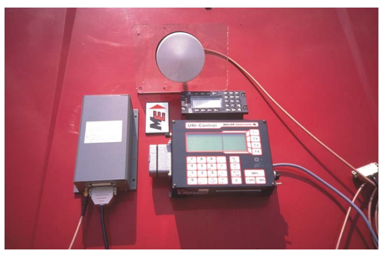
Fig 1. First GPS system and bord computer employed in agriculture in Germany

Prior to GPS positioning, variable rate input of agrochemicals depended on dead reckoning for example by employing the tramline system in combination with ordinance survey maps and topographical surveying in the field (Haneklaus et al. 1997). This approach was labor-intensive, worked, however, satisfactory in flatland areas. In hilly terrain the system failed because of the slip of the machinery.