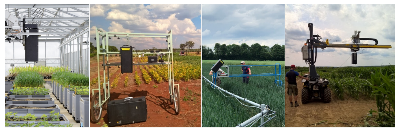
Fig 2. Light Induced Fluorescence Transient (LIFT) instrument (black rectangular camera) integrated in different positioning platforms from left to right measuring various crops in the miniplots, in the field in soybean Embrapa, Brazil, in wheat BreedFACE, Germany and with the field cop measuring maize in the common experiment in Germany,

Raesch, Muller et al. 2014). The operating efficiency of photosystem II (Fg'/Fm') measured with this previous LIFT system correlated well with pulse amplitude modulation (PAM) measurements (r2=0.89) and CO2 assimilation rates (r2=0.94) (Ananyev, Kolber et al. 2005, Pieruschka, Klimov et al. 2010, Pieruschka, Albrecht et al. 2014). But the LIFT also measures photosynthetic parameters thus far not available in proximal sensing such as the functional absorption crosssection(Osmond, Chow et al. 2017) and reoxidation efficiency from 0.8 ms to 5.9 ms (Fr2/Fm)(Keller, Vass et al. 201x).