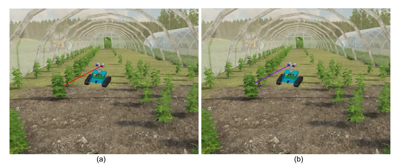
Figure 1. A Simulation for the proposed weed detection and control system, (a) on the left side shows a simulation for the robot in a greenhouse during the detection process using the laser speckle imaging technique, while the image in the right (b) illustrates the control process by a UV-C LED

Once weeds are detected, the system selectively applies UV-C radiation to the identified weed locations using strategically positioned UV-C light sources as shown in Figure (1-b). The intensity and duration of UV-C exposure can be carefully controlled to maximize weed control efficacy while minimizing potential harm to crop plants.