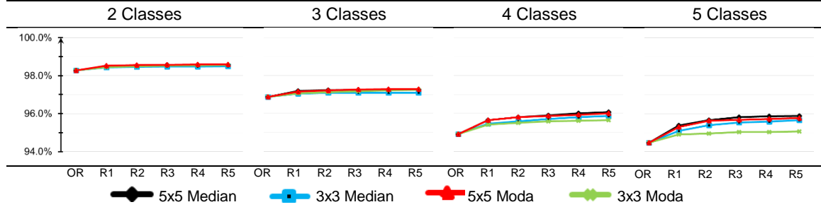
Fig 2 Smoothness index total increase after each rectification

It became evident from graphics of Figure 2 that the smoothness index showed greater variation in the first rectification, and that the index increased proportionally as the number of rectifications increased. It was also possible to identify that rectification methods using 5x5 mask always provide higher total smoothing, and it is more significant when the number of classes increased. The smoothness index showed a similar behavior in relation to all methods used in maps with two and three classes. In case of maps with four and five classes, the 3x3 median method followed the same variation of 5x5 mask methods. On the other hand, 3x3 mode showed lower variation.