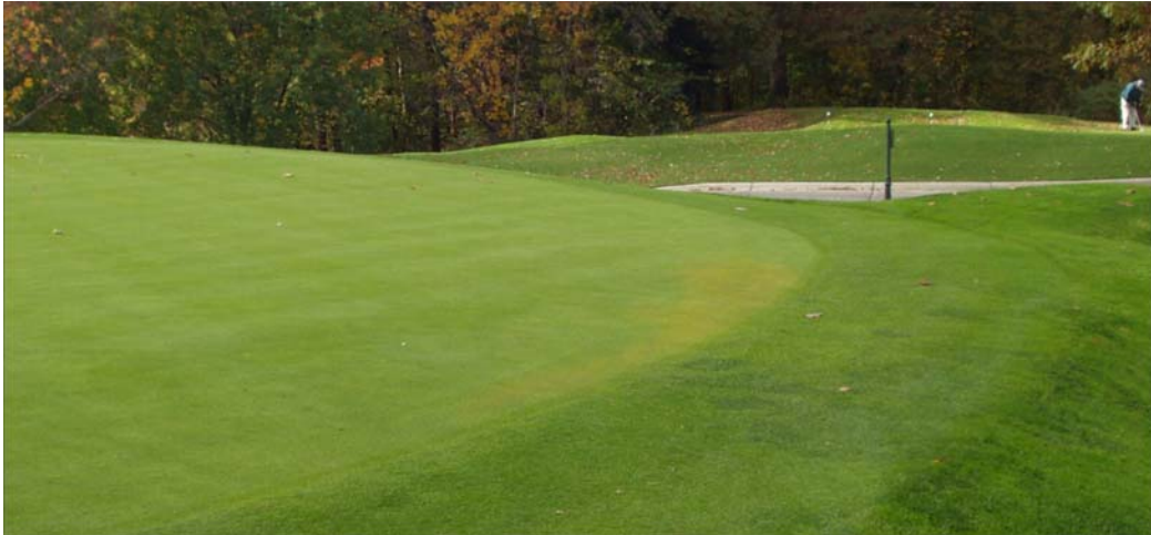
Figure 4. Portion of green 18 that received the largest amount of water during the catch-can audit. This area however does not have the highest soil moisture values and is susceptible to wilt.

Lower quartile and lower half distribution uniformity ( DU_{lq} and DU_{lh} ) and run-time multipliers are shown in table 1. Consistent with earlier findings (Dukes et al. 2006, Mecham, 2001), soil moisture based uniformity is significantly higher than that calculated from the catch can data. Distribution uniformity before and after the irrigation event is very similar. The run-time multiplier based on a lower quartile computation is 33% lower for a soil-moisture based uniformity coefficient. Even for the more conservative calculation based on a lower half computation, the multiplier is on the order of 9% lower. The comparison of uniformity coefficients before and after irrigation agrees with Li et al. (2005) who found that a soil moisture-based coefficient of uniformity before irrigation was found to approximate uniformity after irrigation.