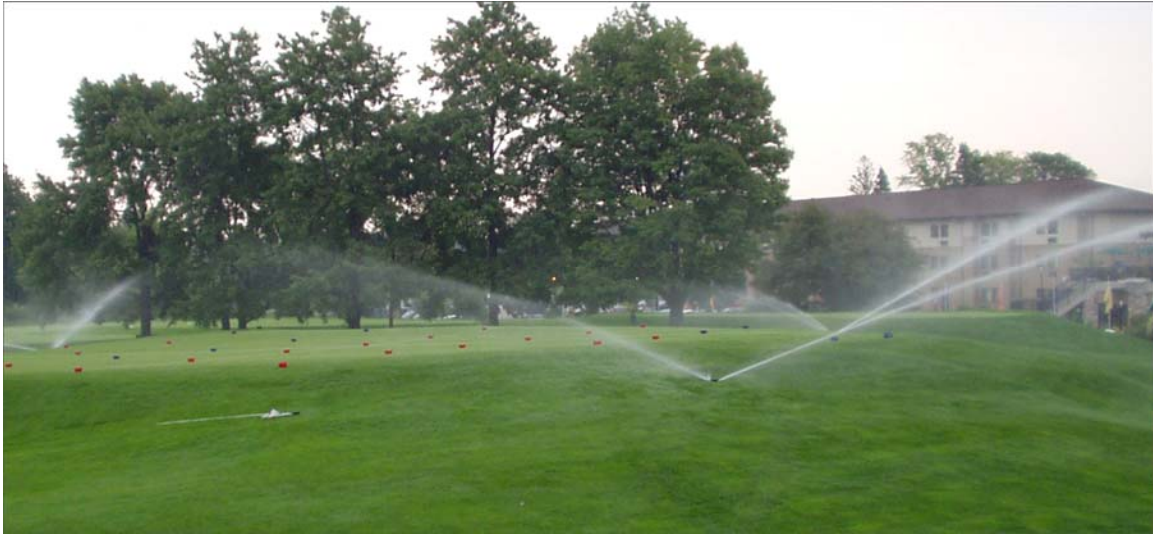
Figure 2. Sprinklers in operation during audit

Lower quartile and lower half distribution uniformities ( DU_{lq} ) were calculated for each of three data sets. 2 dimensional color plots of soil moisture and catch can data were created using the SpecMaps mapping utility (Spectrum Technologies, Plainfield, IL).