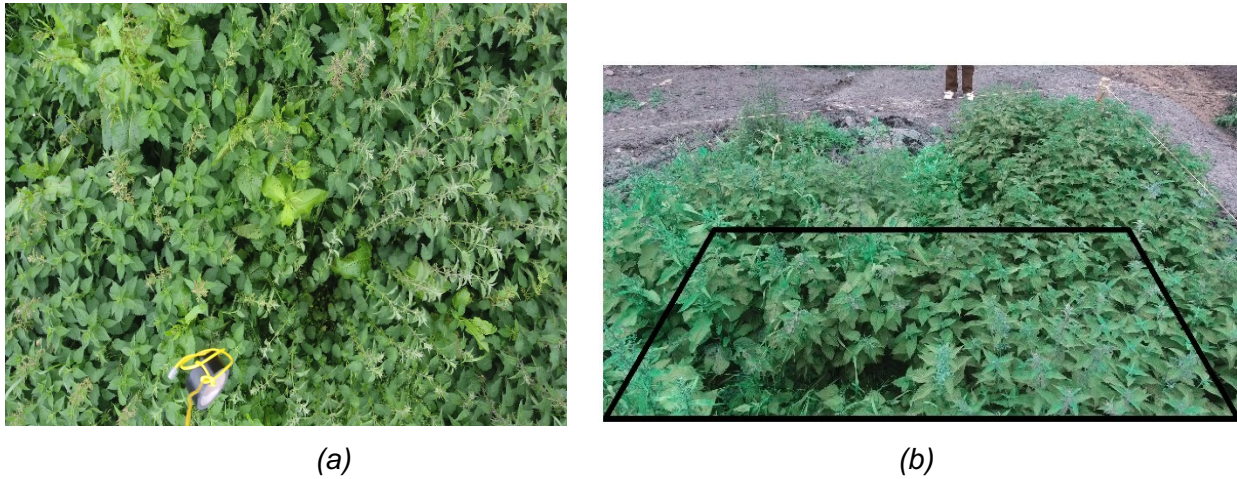
Figure 2: Test Image Acquisition.

(a) Raw 90° test image of Urtica captured from the UAV's cameras. (b) Raw 45° test image of Urtica captured from the UAV's cameras. The grid annotation (outlined area) used for the perspective normalisation is also shown. Image windows were obtained from the annotated region.