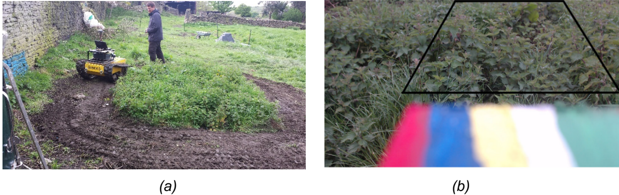
Figure 1: Training image acquisition (from [1]). (a) Plot of Urtica and ground robot (IBEX2) capturing training images from the plot using its on-board cameras. (b) Raw training image of Urtica obtained from the ground robot's cameras. Note the colour bar used for the colour calibration process and the grid annotation (outlined area) used for the perspective normalisation described in the main text (section 2.1). Image windows were obtained from the annotated region.

corresponds to a 64 \times 64 square pixel region of the image. Thus the dewarped image was split into regular 64 \times 64 contiguous and non-overlapping windows.