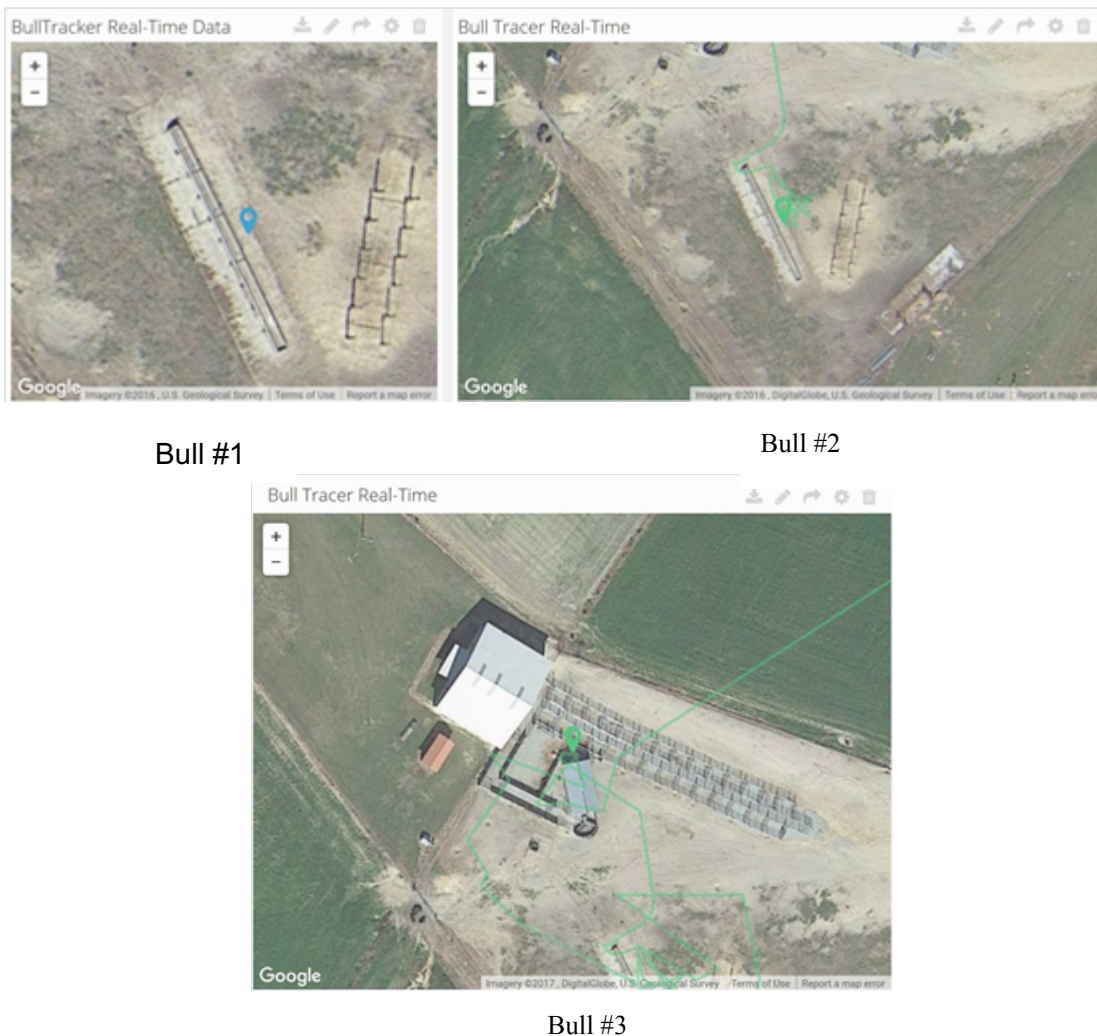
Figure 4. GPS data from the tracking devices attached to the cattle.

The GPS data were viewed at ubidots dashboard ( http://www.ubidots.com ) as shown in Figure 4.