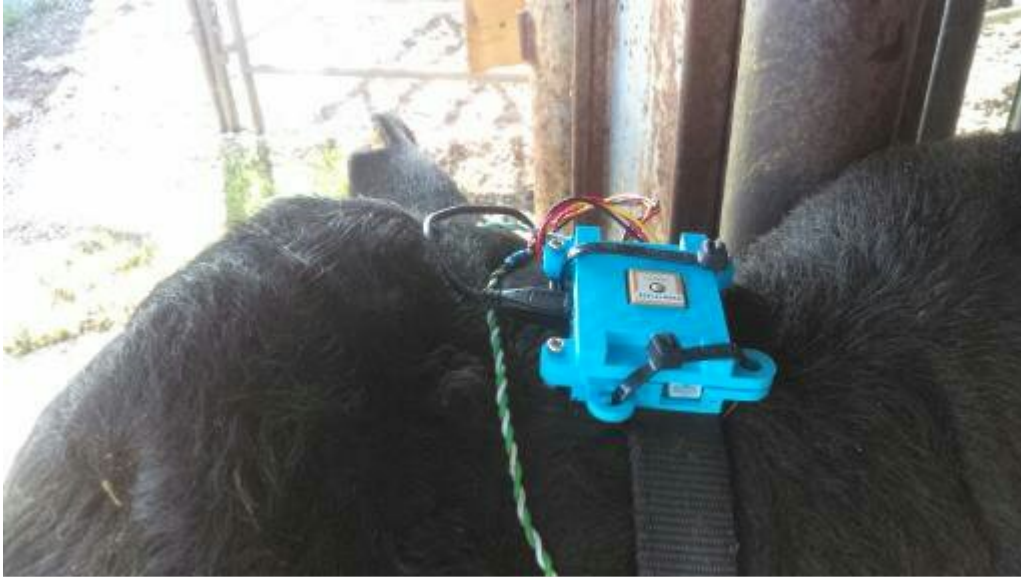
Figure 1.A cattle fitted with our tracking module. The metal parts in the middle is the GPS receiver module.

also available (Fig. 2). Though the accelerometer+magnetometer data was not currently used.