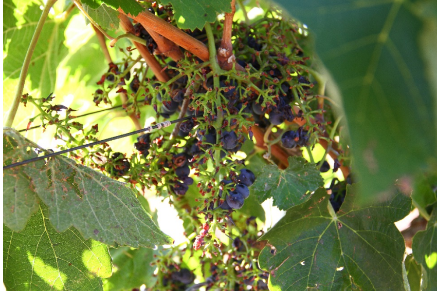
Fig 1. A sample vine showing berry damage caused by the pest birds in the experimental field.