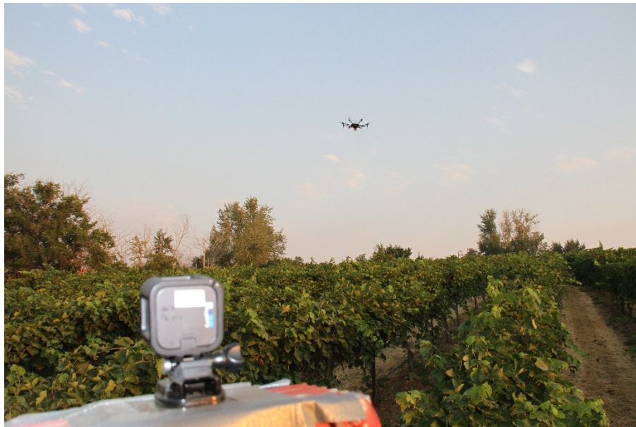
Fig 2. GoPro Hero 5 camera and Matrice M600 Pro UAS in the scene used during the experiment. Trees in the background provided shelter for the birds feeding to the vines in this plot.

Matrice M600 Pro (DJI Inc., China) (Fig 2) was the UAS platform used for the experiment. UAS flight was limited to 3-6m above the canopies. The experimental design consisted of six days of UAS flight (called “a UAS cycle”) and eight days of control observations (also called “a No-UAS cycle”), alternated at an interval of two days, for a total of a 14-day experiment. On a flight day, the UAS was flown for around five hours so as to keep the birds away from the field during the peak bird activity time in the morning and evening. When Matrice was down for battery swapping, Phantom 4 (DJI Inc., China), which is a much smaller UAS platform, was flown to continue patrolling the plot.